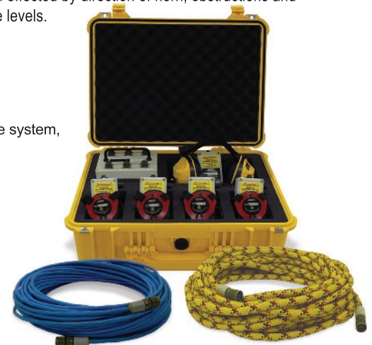
Rescom ® Modular TM 5 man system